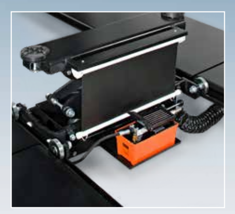
JACK (DPTIONAL) The sliding jack increases versatility as lift also can be used for brake service.

Clear and easy to understand, with emergency switch and comfort lowering which allows the automatic release of the carriage from the safety lock when lowering the lift.